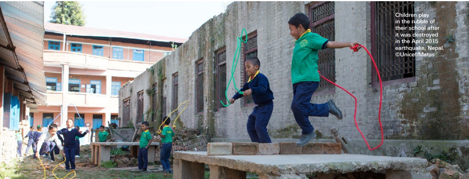
Children play in the rubble of their school after it was destroyed in the April 2015 earthquake, Nepal.