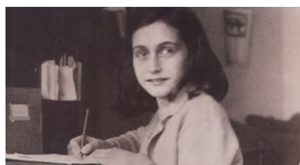
Anne Frank (1929–45)