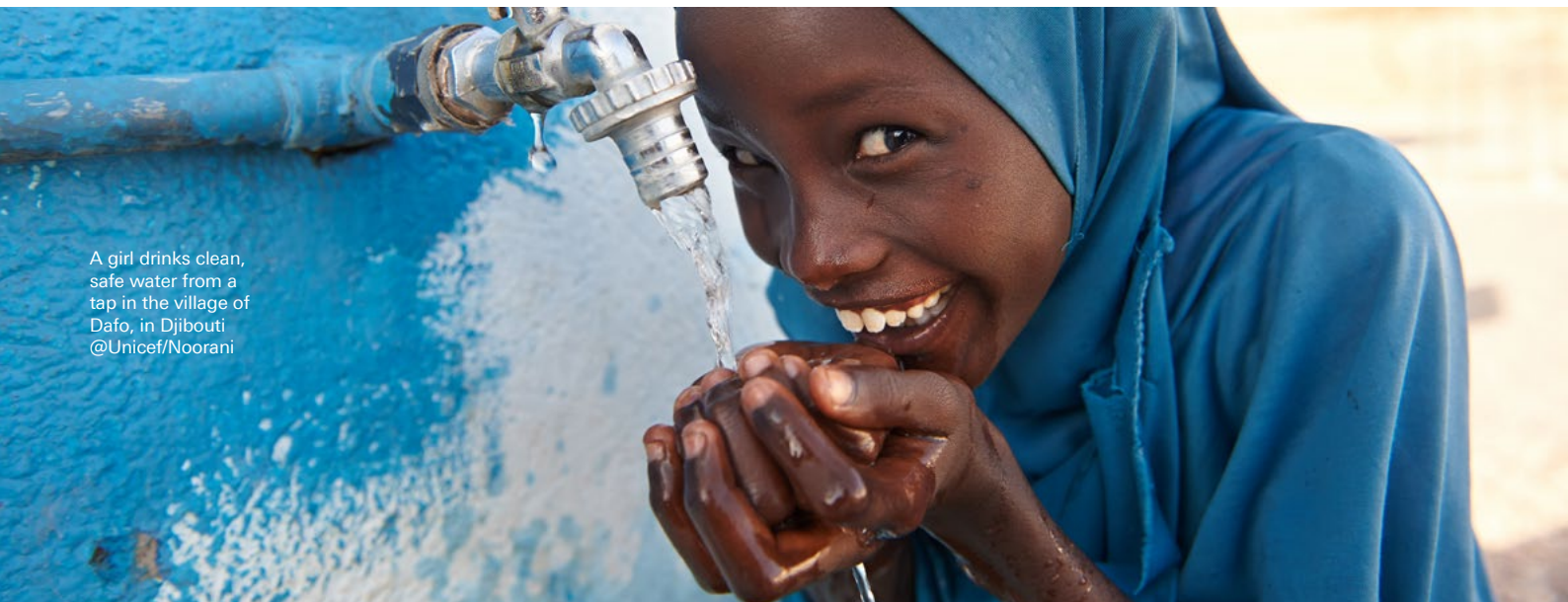
A girl drinks clean, safe water from a tap in the village of Dafo, in Djibouti