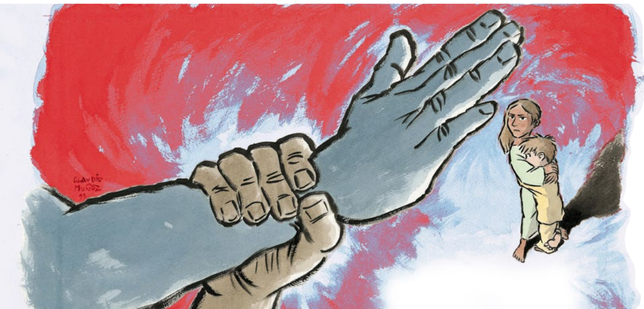
Claudio Muñoz's illustration of Article 19 from the UN Convention on the Rights of the Child.