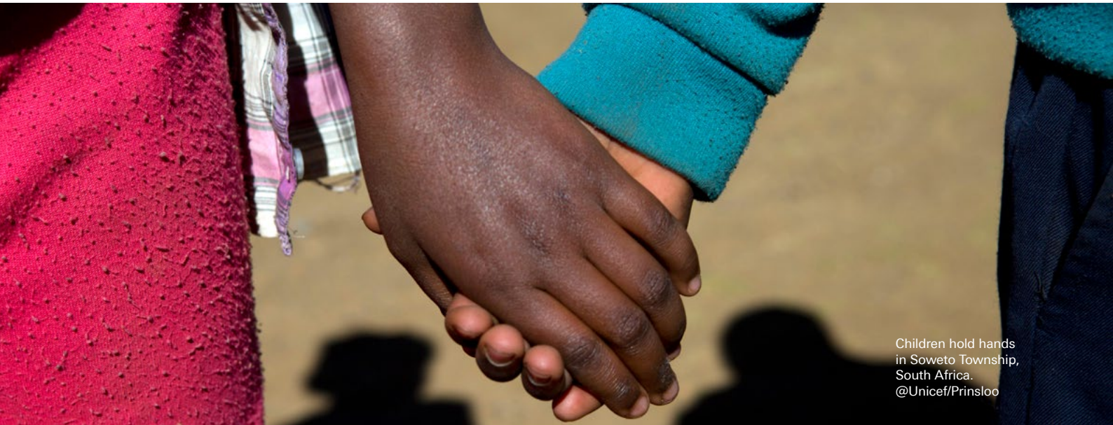
Children hold hands in Soweto Township, South Africa.