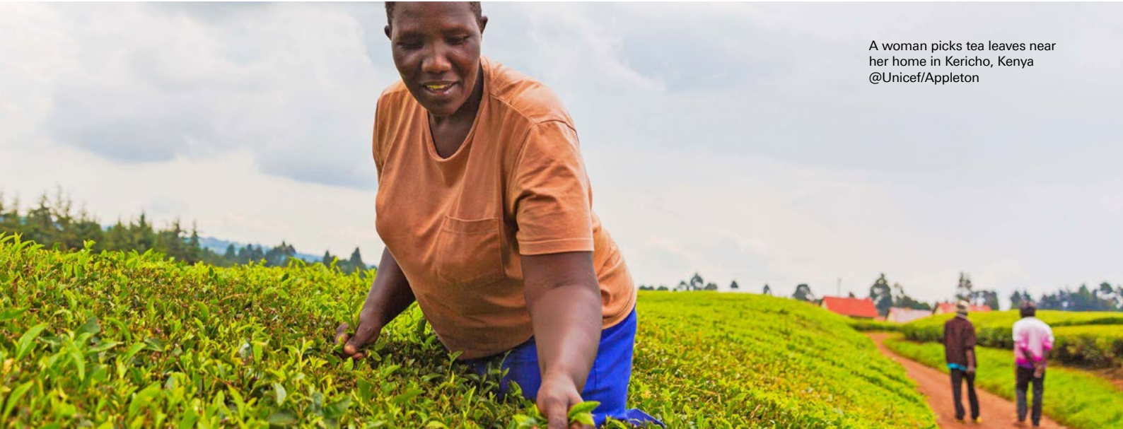
A woman picks tea leaves near her home in Kericho, Kenya