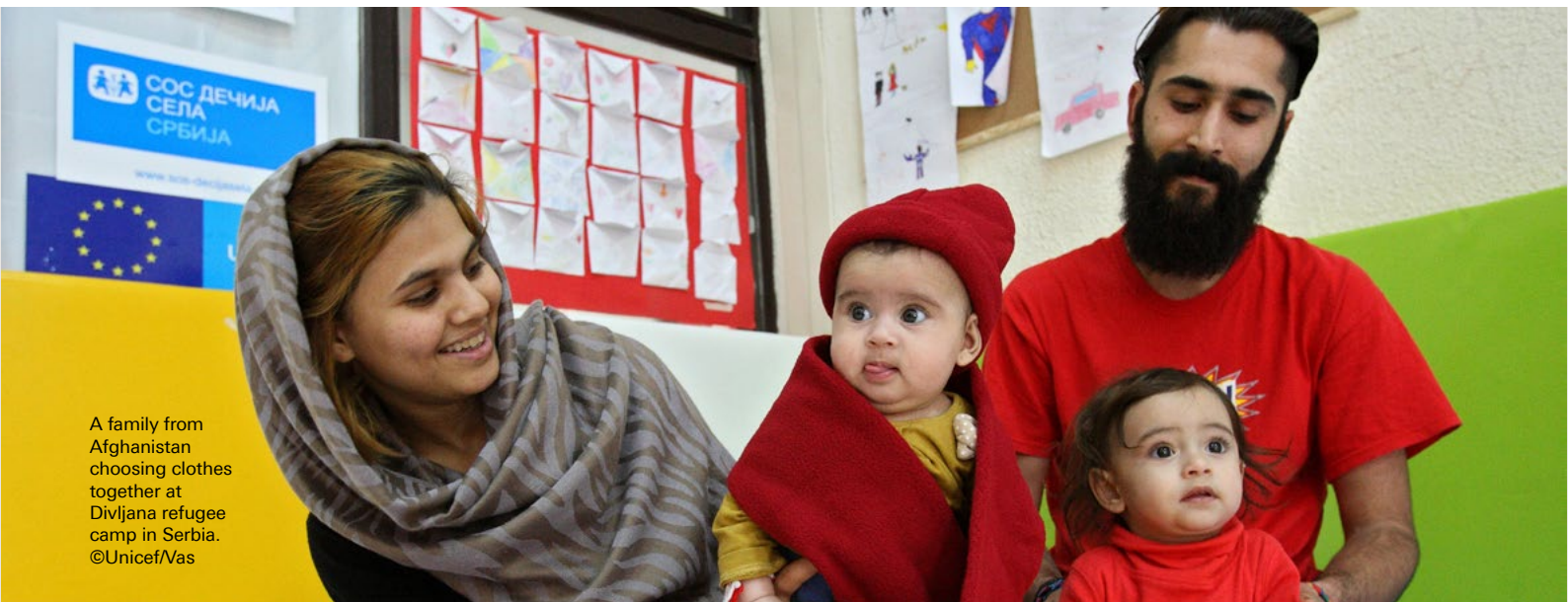
A family from Afghanistan choosing clothes together at Divljana refugee camp in Serbia.