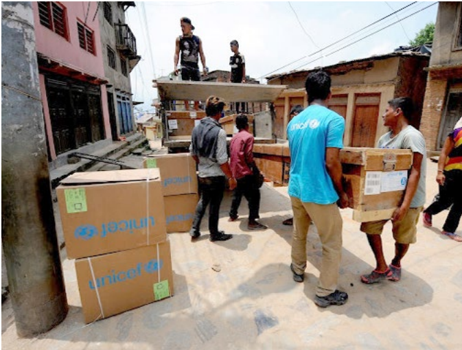
[Project picture: Image 3.]

The government is working on improving the early warning system so that everyone can be ready if another earthquake happens.