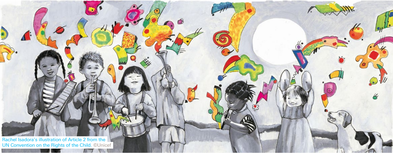
Rachel Isadora's illustration of Article 2 from the UN Convention on the Rights of the Child.