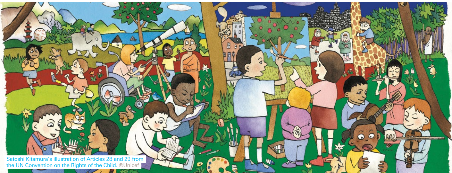
Satoshi Kitamura's illustration of Articles 28 and 29 from the UN Convention on the Rights of the Child. ©Unicef