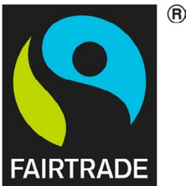
The FAIRTRADE mark

[There could be wide range of responses looking at the responsibilities of people in the UK to pay a fair price so children in other countries are able to realise their rights to education, health, nutritious food, and so on.]