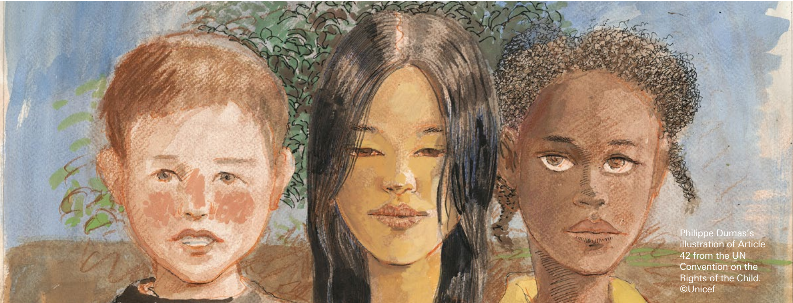
Philippe Dumas's illustration of Article 42 from the UN Convention on the Rights of the Child. ©Unicef