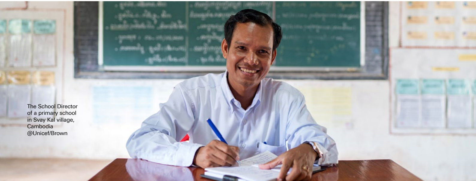
The School Director of a primary school in Svay Kal village, Cambodia