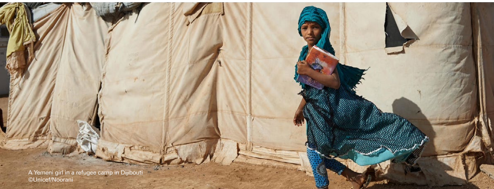
A Yemeni girl in a refugee camp in Djibouti