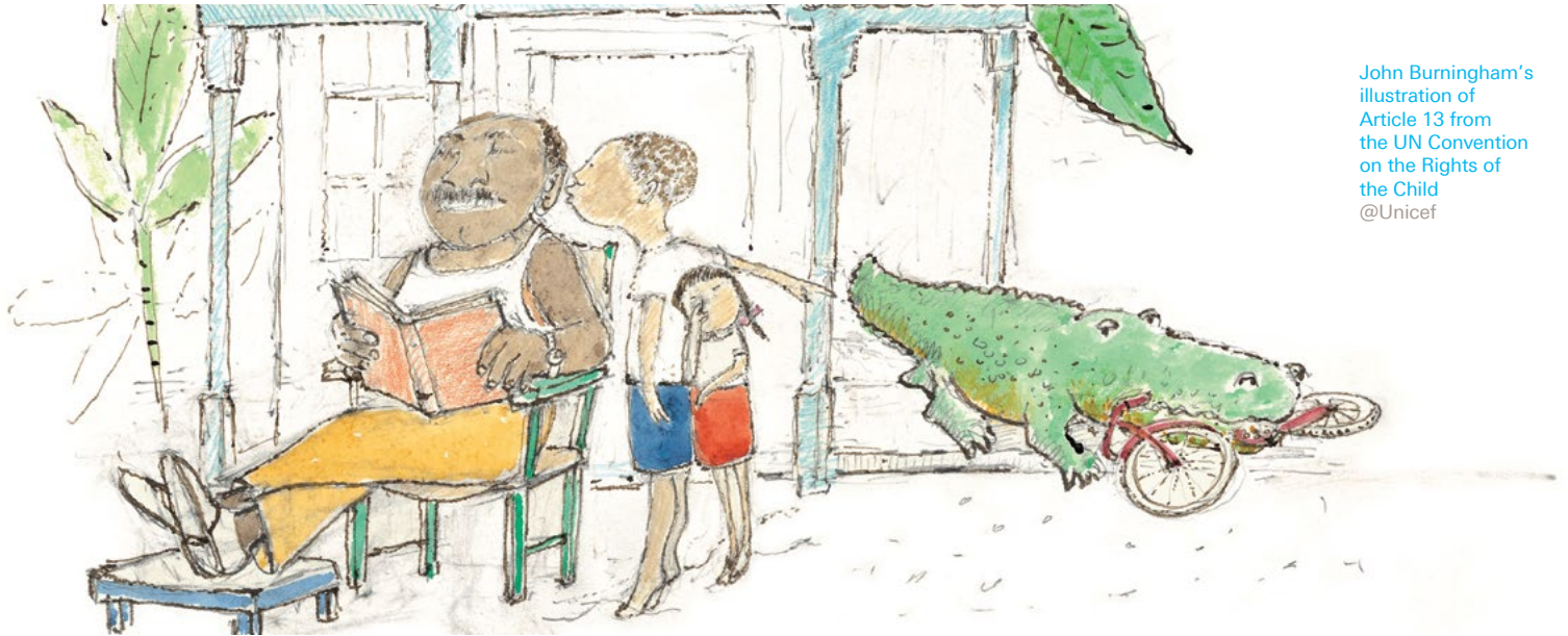
John Burningham's illustration of Article 13 from the UN Convention on the Rights of the Child @Unicef